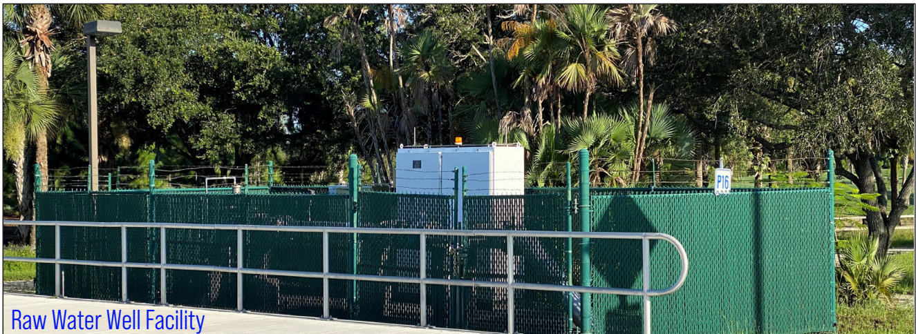
Raw Water Well Facility

For more information about the project or to sign up for project email updates, visit the website at www.FortMyersUtilities.com or contact the City's public information consultant for the project: