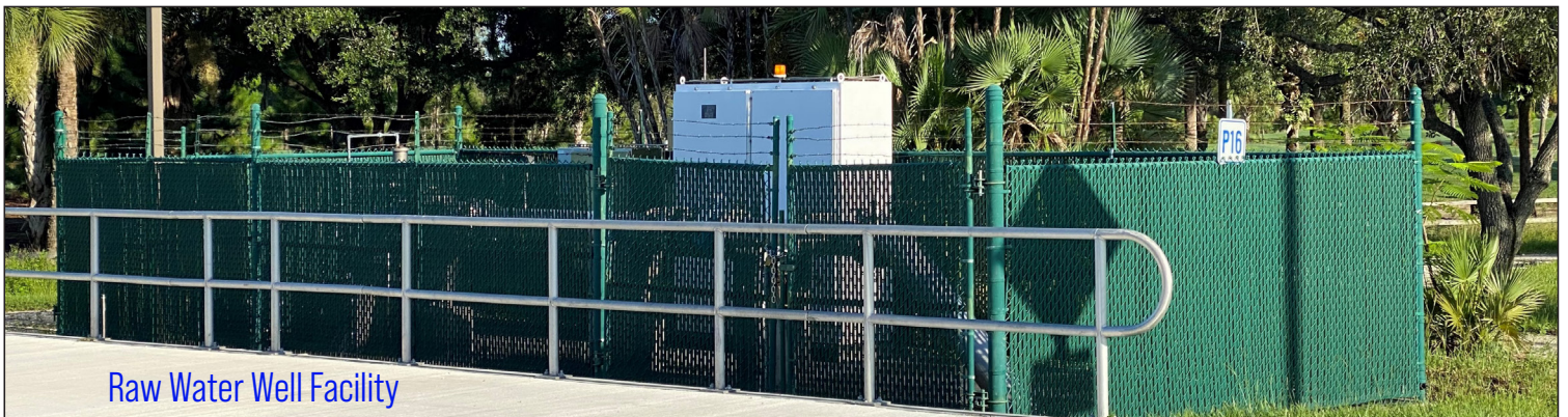
Raw Water Well Facility

For more information about the project or to sign up for project email updates, visit the website at www.FortMyersUtilities.com or contact the City's public information consultant for the project: